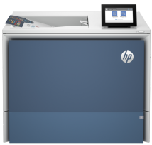
HP Color LaserJet Enterprise 5700dn Printer

This printer is intended to work only with cartridges that have a new or reused HP chip, and it uses dynamic security measures to block cartridges using a non-HP chip. Periodic firmware updates will maintain the effectiveness of these measures and block cartridges that previously worked. A reused HP chip enables the use of reused, remanufactured, and refilled cartridges. More at: http://www.hp.com/learn/ds