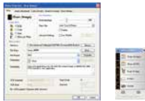
The Button Manager V2 main screen

Button Manager V2 makes it easy for you to scan and send your image to your favorite destinations with a press one button. Now the new version comes with an innovative feature to let you scan and automatically upload the scanned document to popular cloud repositories such as Google Docs, Microsoft SharePoint or FTP. In addition, the iScan feature allows you to insert the scanned image or recognized text after optional OCR (Optical Character Recognition) process to your text editor such as Microsoft Word to get your job done easily and quickly.